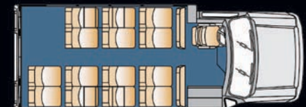
14 Passenger with Activity Bus Seats