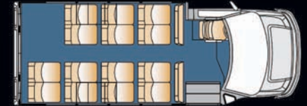
14 Passenger with Activity Bus Seats