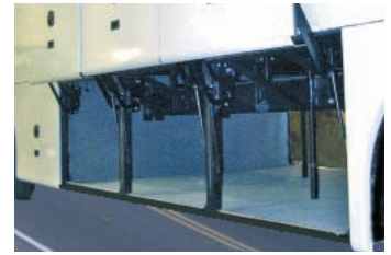
Pass-Thru Luggage Compartments