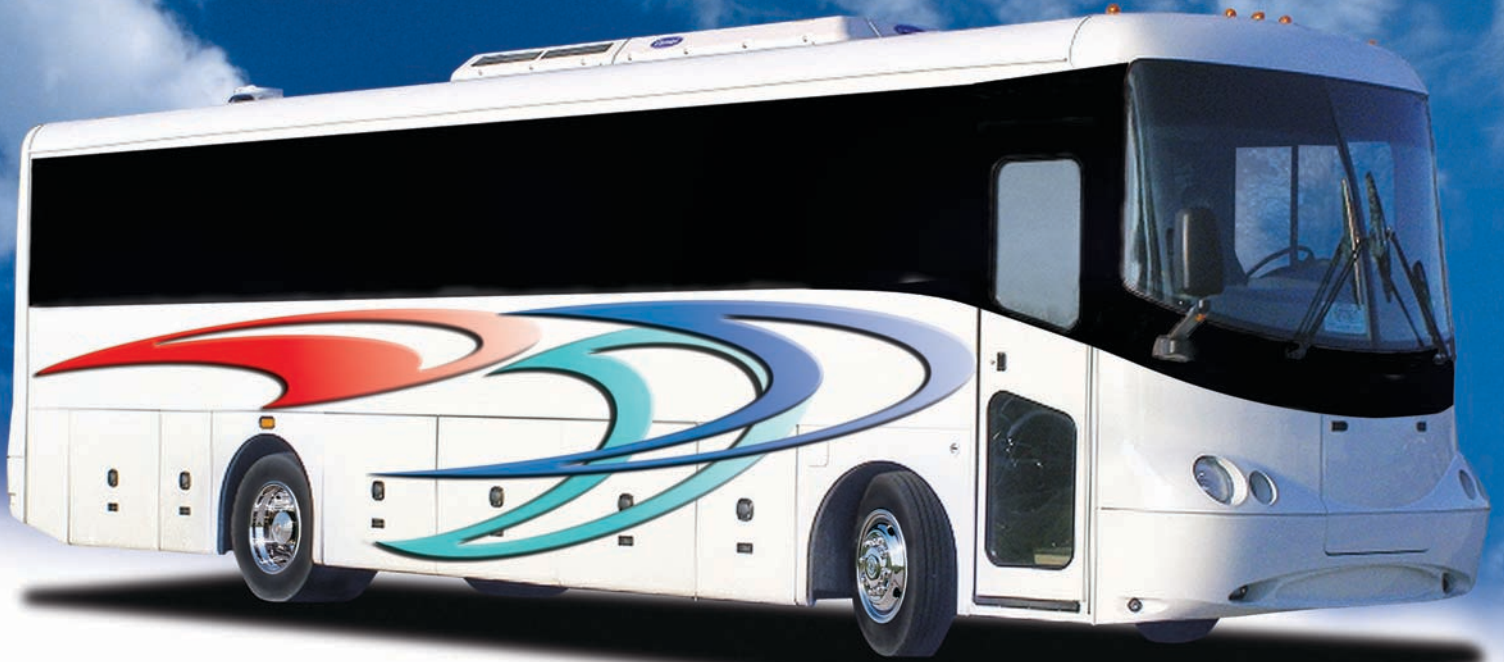
Synergy shown with optional equipment