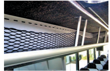
Overhead Luggage Racks